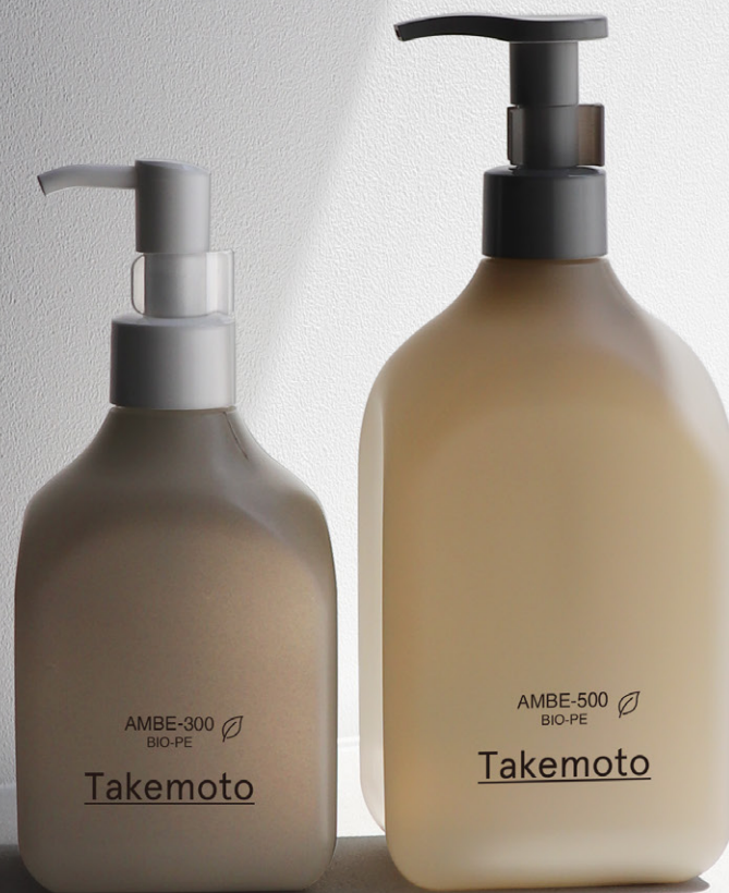
Pump (from the left) : PD-P1024B II Pump / PD-P1024EB II Pump Bottles (from the left) : AMBE-300 / AMBE-500