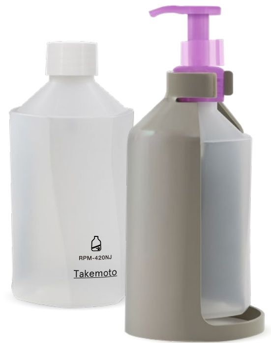
RPM-420NJ M-Cap with inner ring (for refill bottle)